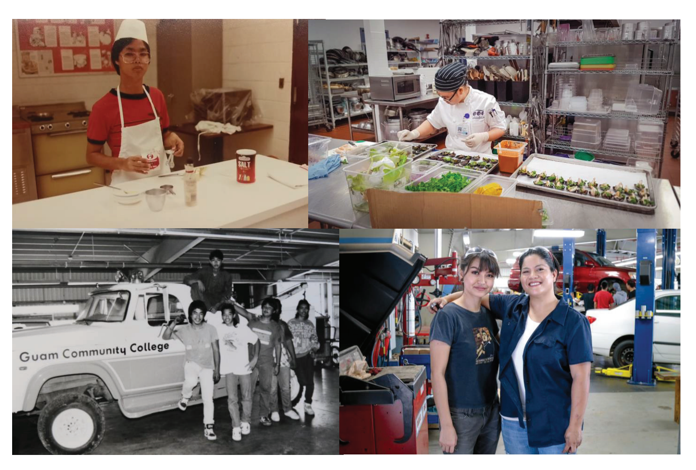
Then and Now Photos of GCC's Culinary Arts and Automotive Programs