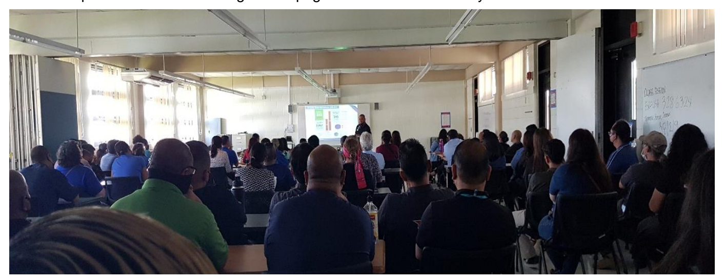
Figure 1. Active Shooter Awareness/Training presented by the Environmental Health & Safety Office and Guam Homeland Security/Office of Civil Defense.

Training sessions on Active Shooter and natural disaster (storms or typhoons) awareness/trainings for employees were hosted by the Environmental Health & Safety Office in partnership with the Guam Home Security/Office of Civil Defense and