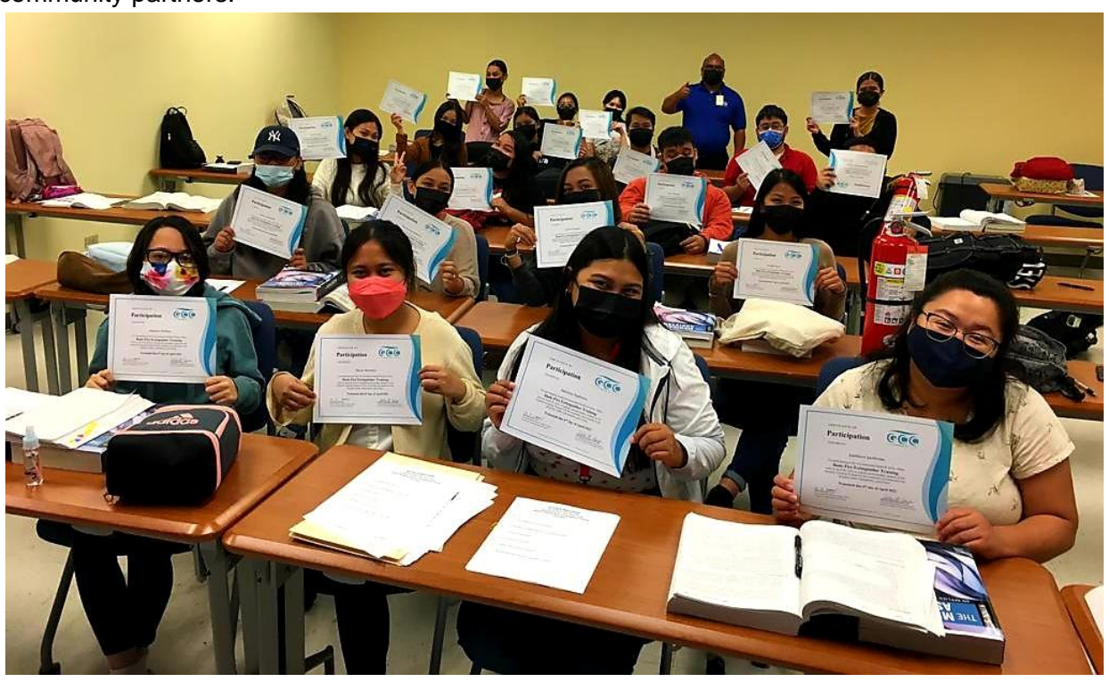
Figure 2. Fire Extinguisher Training for the Allied Health Nursing students presented by the Environmental Health & Safety Office

The EHSO will also conduct a fire extinguisher training for employees in October 2022.