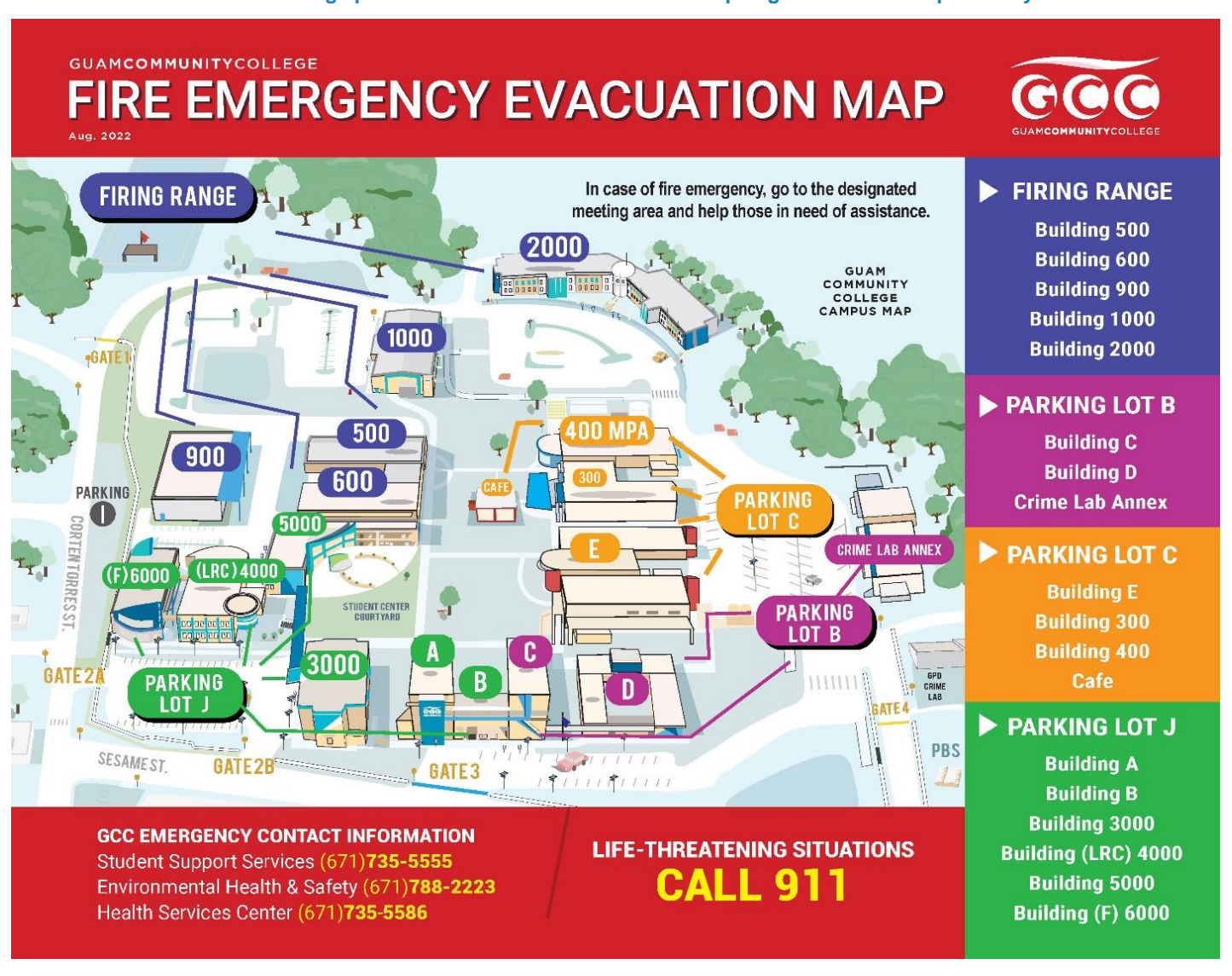
Figure 4. The Fire Emergency Evacuation Map is posted throughout the campus for students and employees' information, such as classrooms, labs, auto and carpentry shops, Learning Resources Center, Student Center, Health Services Center, Book Store, employees' offices, GCC café, Student Lounge, conference rooms and other meeting spaces. It is also available online at <a href="https://guamcc.edu/CampusSafety">https://guamcc.edu/CampusSafety</a>.