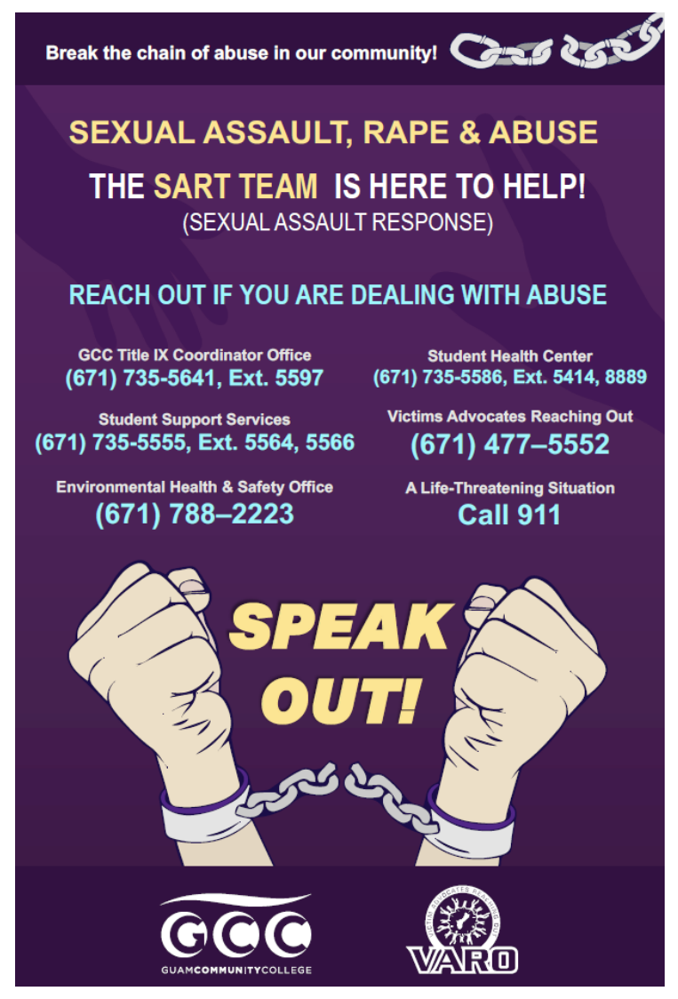
Figure 6. The Sexual Assault Response Team's awareness information is posted throughout the campus for students and employees. It is also available on <a href="https://guamcc.edu/CampusSafetv.">https://guamcc.edu/CampusSafetv.</a>

The Title IX Coordinator is responsible for monitoring that GCC is compliant with all Title IX and federal policies regarding Sexual Discrimination.